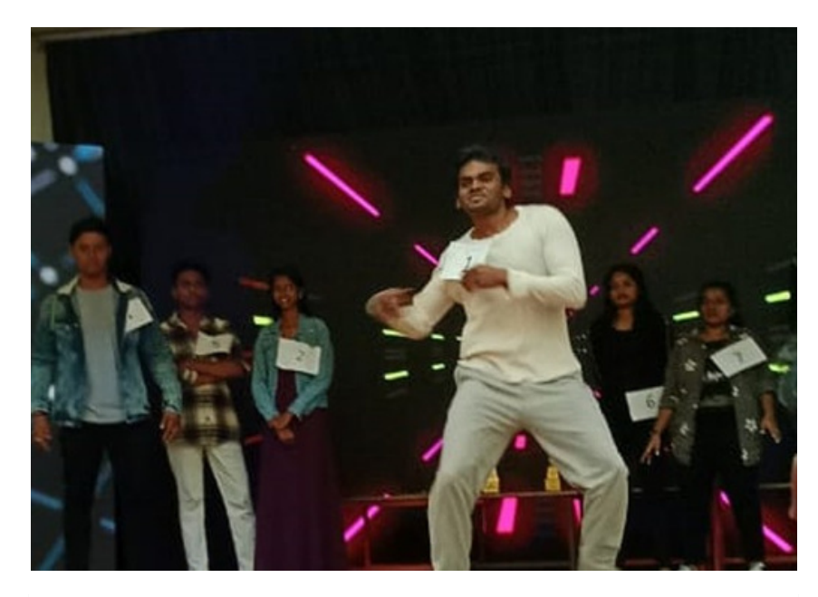
Consolation Karthik-III BCOM Team 1 Igniters