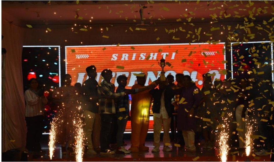
Winners of Rolling Trophy – Team JWALA