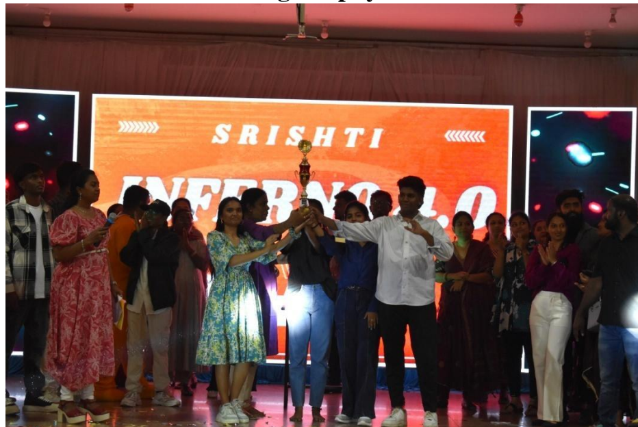
Runners – Team AGNI