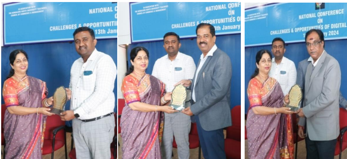
Felicitation to the Dignitaries