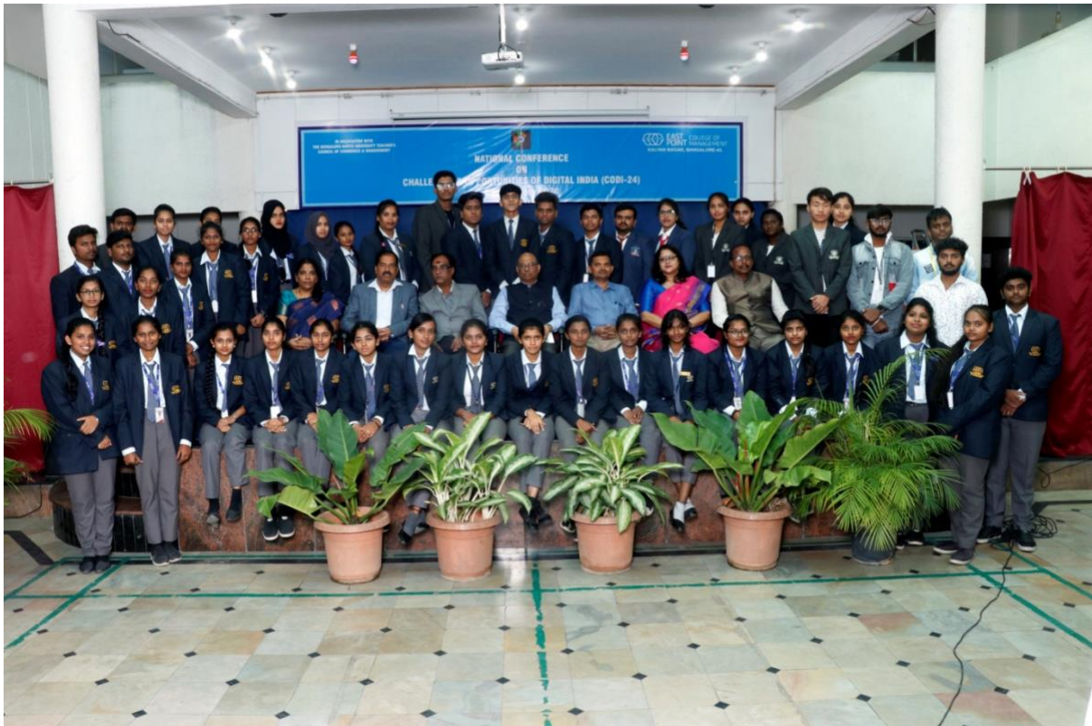
Participants from various colleges