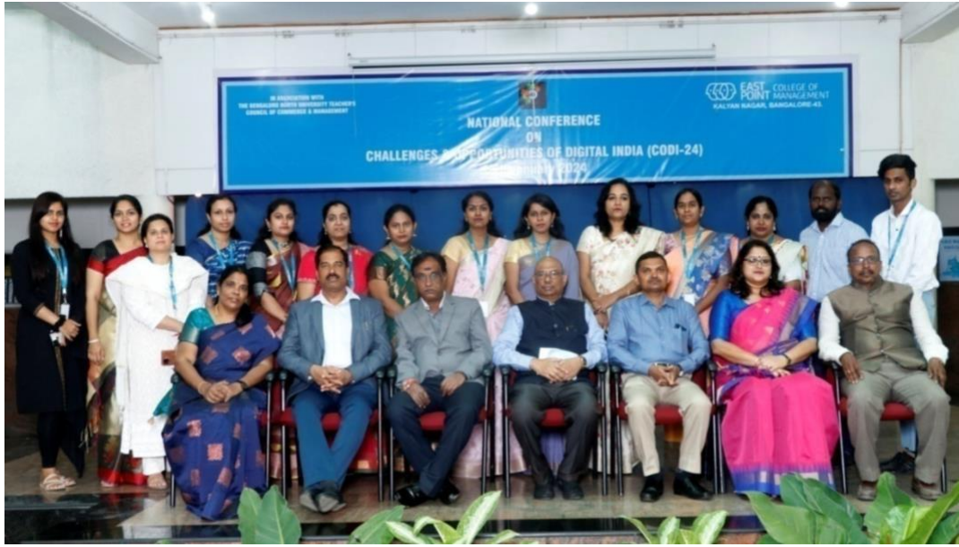
EPCM Staff with the Dignitaries