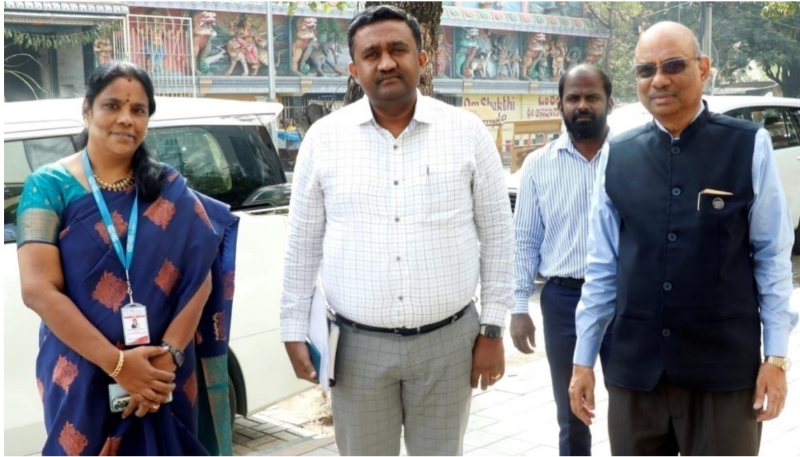
Welcoming the Chief Guest Registrar