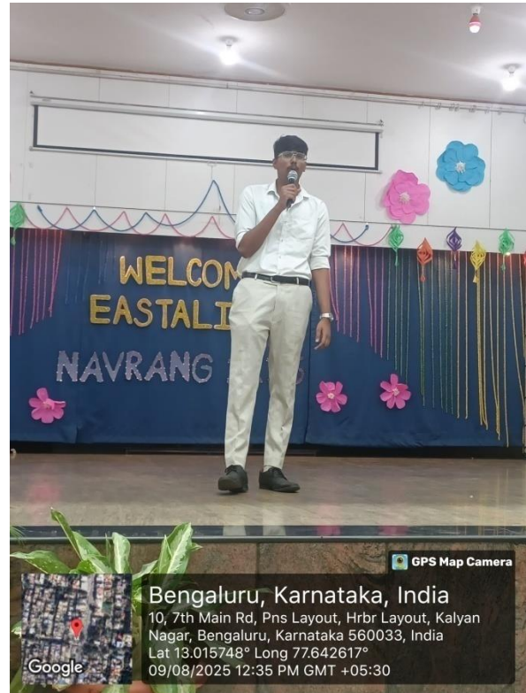
Song by Fresher Clemont